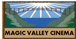
MAGIC VALLEY CINEMA

Boise Post Falls Blackfoot Meridian St. Anthony Twin Falls