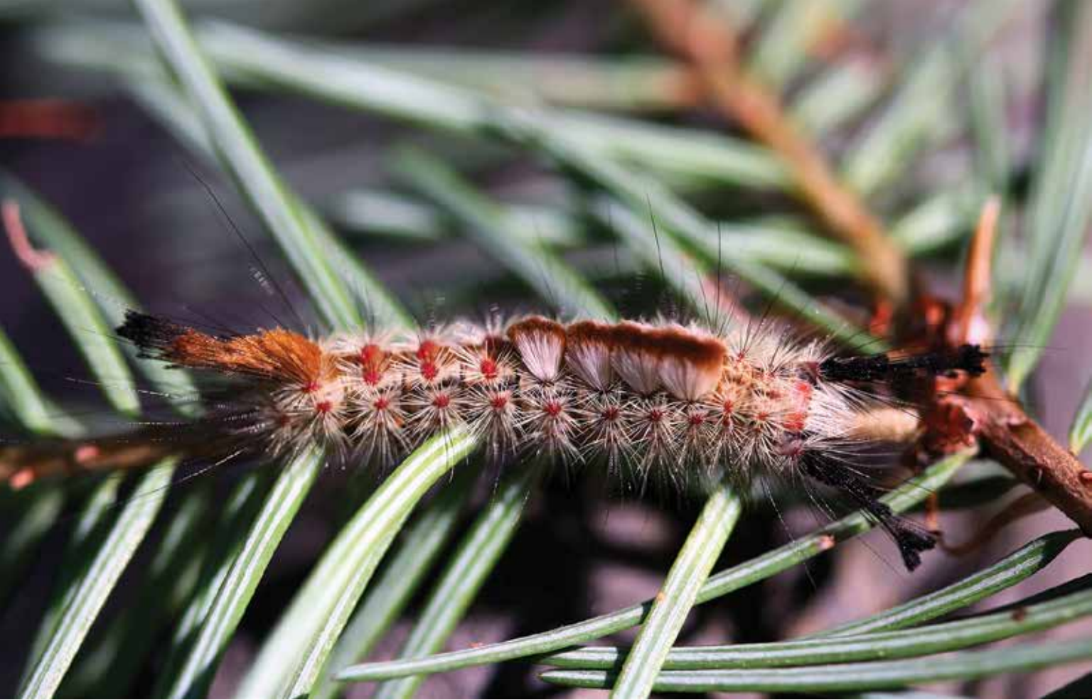
A mature Douglas-fir tussock moth larva.